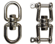
Eye to eye Jaw to jaw

316 marine-grade stainless steel. Available as jaw-to-jaw or eye-to-eye types. Not certified for lifting purposes.